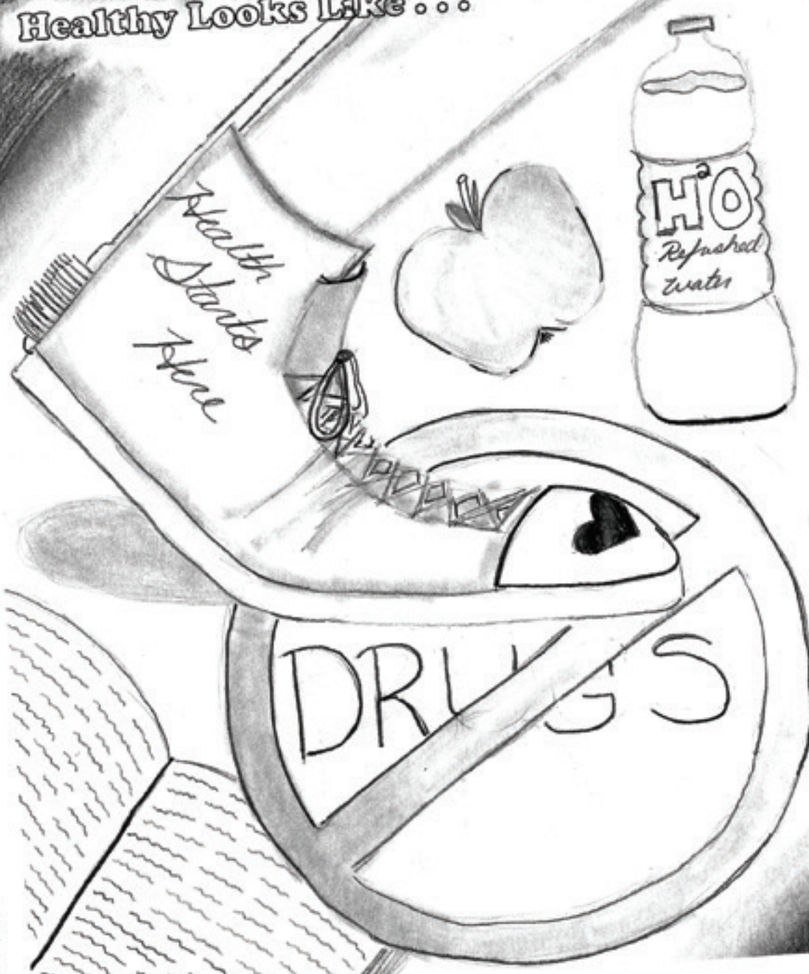
SoonerFit Poster winner, 11 Years Old -- Riverside