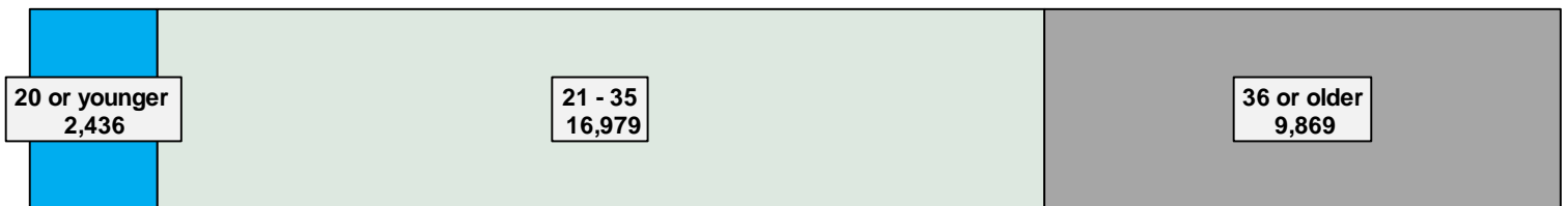
Age Breakdown of Total SoonerPlan Enrollment

Race is self-reported by members at the time of enrollment. The Two or More Race members have selected two or more races. Hispanic or Latino is an ethnicity not a race. Hispanics or Latinos can be of any race and are accounted for in a race category above.