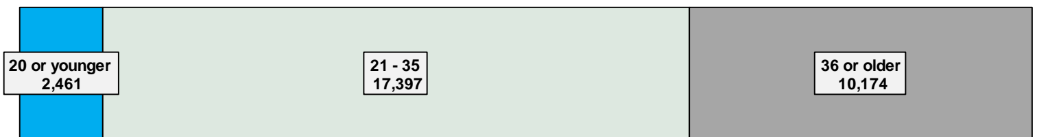
Age Breakdown of Total SoonerPlan Enrollment

Race is self-reported by members at the time of enrollment. The Two or More Race members have selected two or more races. Hispanic or Latino is an ethnicity not a race. Hispanics or Latinos can be of any race and are accounted for in a race category above.